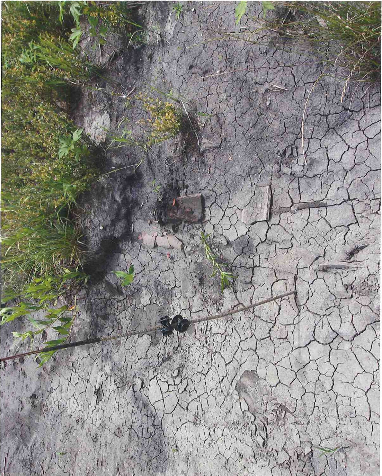
Old 6" Abandoned TIE